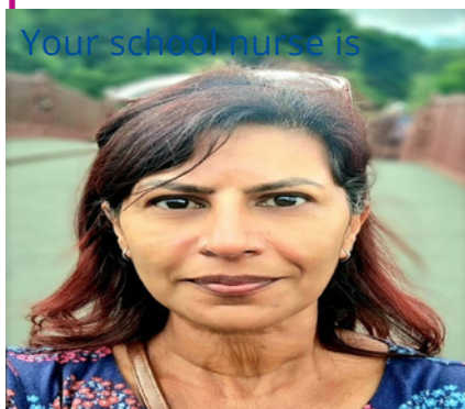
Your school nurse is

For more info visit: bit.ly/ChatHealthCCHP